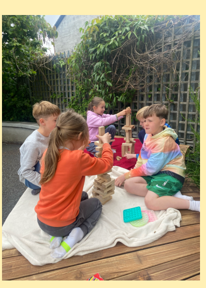
JENGA FUN ON YARD