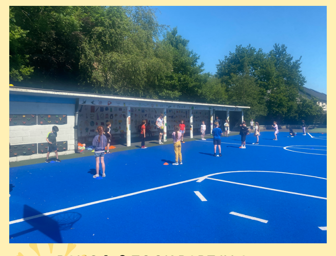
RANG 1-6 TOOK PART IN A SKILLZ WORKSHOP TODAY