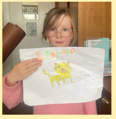
RANG 1 VISITED THE OFFICE TO SHOW OFF THEIR FACT FILES THIS WEEK - MAITH SIBH!