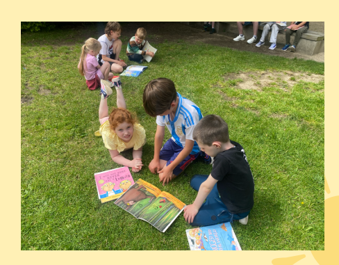
BUDDY READING SI AND RANG 3 - ENJOYING THE SUN