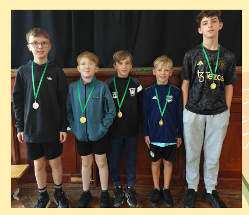
WELL DONE TO OUR SPORTS DAY MEDAL WINNERS!