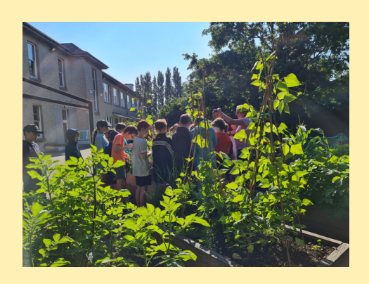
THE VEG GARDEN IS IDYLLIC THIS MORNING - AN UNBELIEVABLE AMOUNT OF VEG TO SEE. PEAS, BEANS, CORN , ROCKET, KALE , POTATOES , STRAWBERRIES , TOMATOES AND MORE! WELL DONE TO OUR TEAM OF GARDENERS FOR MINDING THE VEG BEDS SO WELL!