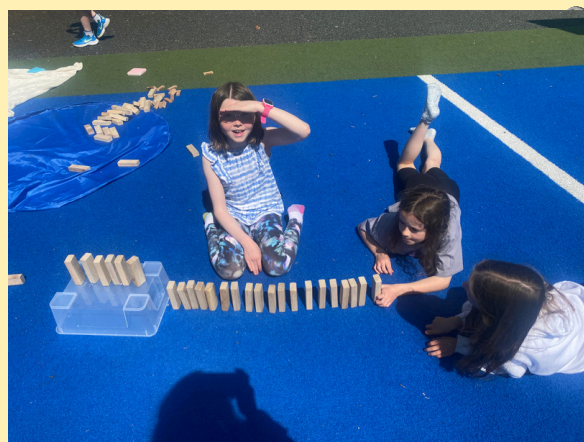
MORE GAMES ON YARD