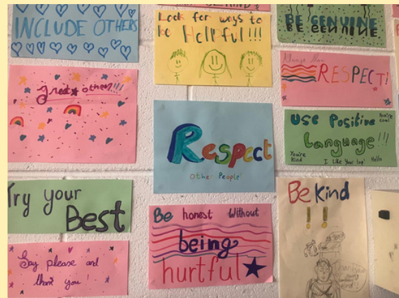
Positive Behaviour posters from Rang 2 and 5