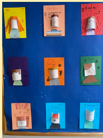
SELF-PORTRAITS RANG 2

RANG 6 HAS ASSUMED RESPONSIBILITY FOR CARING FOR OUR "POCKET FOREST" AT LORETO PARK. THIS PROJECT BEGAN THREE YEARS AGO. WE PLANTED 11 NATIVE SPECIES USING THE JAPANESE MIYAWAKI METHOD, WHICH FOSTERS RAPID GROWTH AND DENSE VEGETATION.