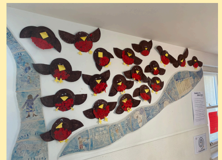
RANG 1 ROBINS