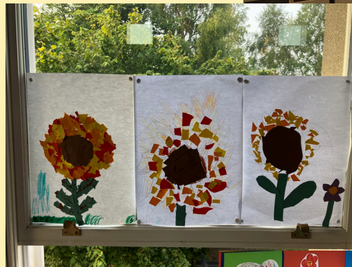
2nd class Artwork