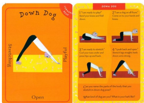
Yoga Pose – Down Dog (see RETNS website)

The Green Team are also promoting 'Save our Seas Spring'. They are encouraging all families to reduce the use of single-use plastic and have shared suggestions such as plastic containers or beeswax wrappers that can be used every day.