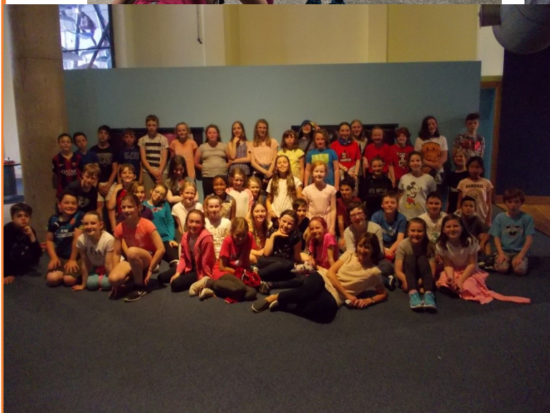
SUMMER FUN At W5 AND ON THE SPONSORED WALK!!