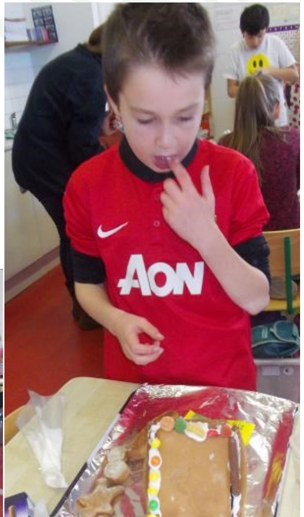
5th Class & parents making festive Gingerbread houses